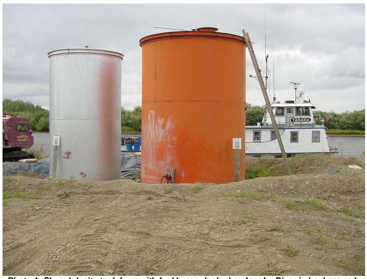
Photo 1: Shageluk city tank farm with fuel barge docked on Innoko River in background.